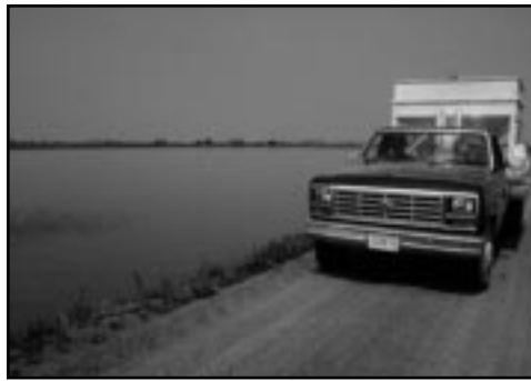
Figure 2. Availability of natural foods must be considered when feeding baitfish prepared feeds.

To determine the lipid requirements of golden shiners and goldfish, UAPB researchers fed the fish (in aquaria) diets containing graded levels of lipid. Golden shiners grew well when fed diets with 7 to 12 percent lipid, but peak growth occurred when fish were fed the diet containing 12 percent lipid. In a similar study, goldfish fed diets with 4.5 to 7 percent lipid had the greatest weight gain. However, goldfish fed a 4.5 percent lipid diet had a lower survival rate than fish fed 7 to 13 percent lipid. This indicates a larger amount of lipid is necessary to maximize production of goldfish in aquaria.